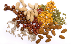
Herbs & Spices